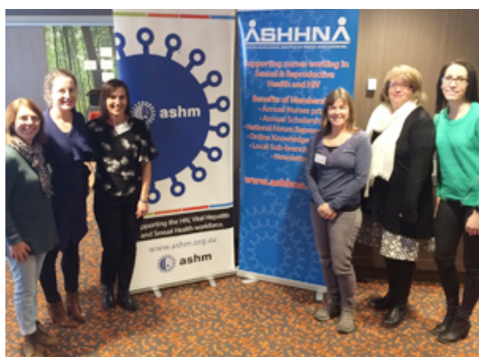
Pictured: ASHM and ASHHNA members attending the 2-day Short Course in Sexual Health Nursing (Canberra 4-5 August)

https://www.surveymonkey.com/r/2017_ASHM_Nurse_member_survey