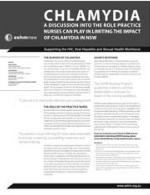
At the 2012 IUSTI Conference ASHM presented a poster discussing the role of nurses in limiting the impact of Chlamydia

All of the projects to support the nursing workforce are done so collaboratively with organisations such as NSW Sexually Transmissible Infections Programs Unit (NSW STIPU), Australasian Hepatology Association (AHA), Australasian Sexual Health & HIV Nurses Association (ASHHNA) and Australian Primary Health Care Nurses Association (APNA).