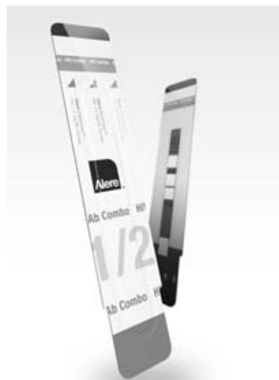
The Alere Determine HIV Combo Test was the first PoCT to be approved for use in Australia. ASHM has produced a Nationally Endorsed Curriculum for PoCT training.

In 2012-2013 preliminary discussions were under way about new partnerships with the Philippines AIDS Society and Malaysian Society for HIV Medicine. ASHM was also approached about supporting the establishment of HIV professional societies in Myanmar and Laos.