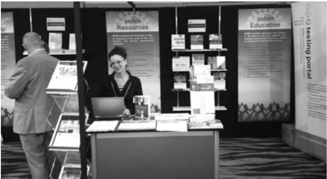
ASHM membership has a two-pronged approach: it strives to reach a broader audience through its affiliate program while maintaining a core group of committed, voting members.

**Offered to course attendees for the remainder of the financial year.