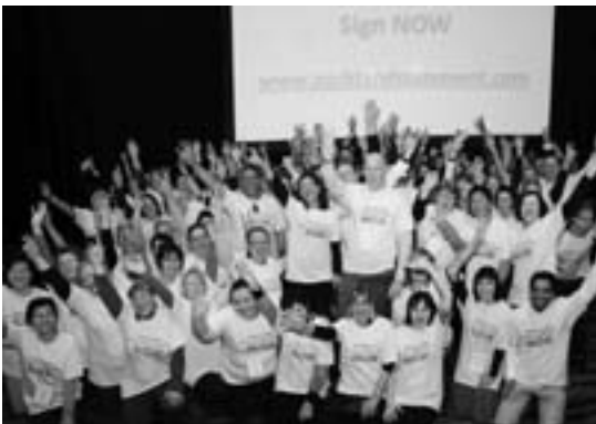
The Auckland Statement, launched at the 8th Australasian Viral Hepatitis Conference, called for new targets, including doubling the number of people with viral hepatitis receiving treatment each year.

The Auckland Statement also calls for a roll out of needle and syringe programs in prisons, and a doubling of safe injecting equipment made available to the community. In August 2012 ASHM joined other key health organisations in welcoming the ACT Government's decision to introduce a Needle and Syringe Exchange Program in an ACT prison. The decision was part of a new health strategy to tackle blood-borne viruses at the Alexander Maconochie Centre.